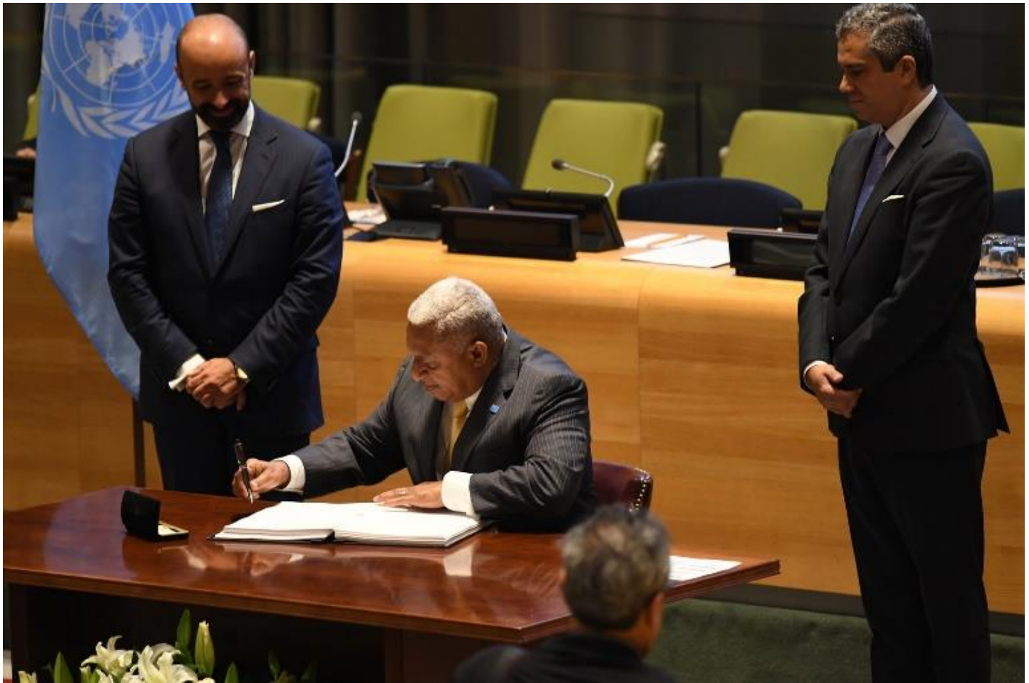
Figure 6: Josaia Voreqe Bainimarama, Prime Minister of Fiji, signs the Treaty on the Prohibition of Nuclear Weapons, 20 September 2017.