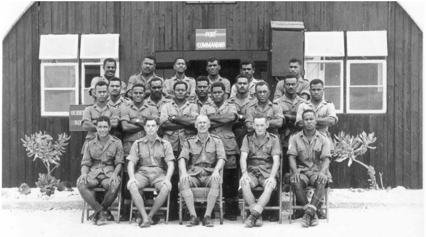
Figure 2: Fijian troops on Christmas Island during the UK nuclear weapons testing program. Photo courtesy of Mrs Loata Masi and Nic Maclellan. https://www.radionz.co.nz/international/pacific-news/340397/author-challenges-british-denial-over-pacific-nuclear-legacy

... were not systematically monitored, and personal protection was minimal. 6