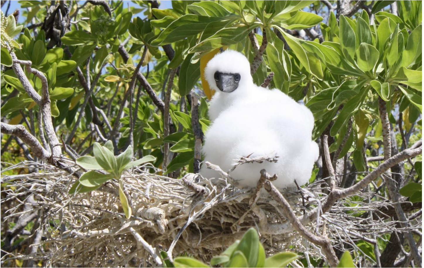
Figure 5: The islets in the Kiritimati lagoon provide vital nesting grounds for the island’s 16 million birds. During Operation Grapple, many Fijian troops were tasked with gathering birds killed, blinded and injured by the nuclear weapons tests and dumping them in the ocean.

However, the colonial-era policies ‘have a clear moral force, showing that the British authorities understood that they had an ongoing responsibility to address any injury or illness to the Fijian military personnel...as well as to their families, widows and orphans.’ 33