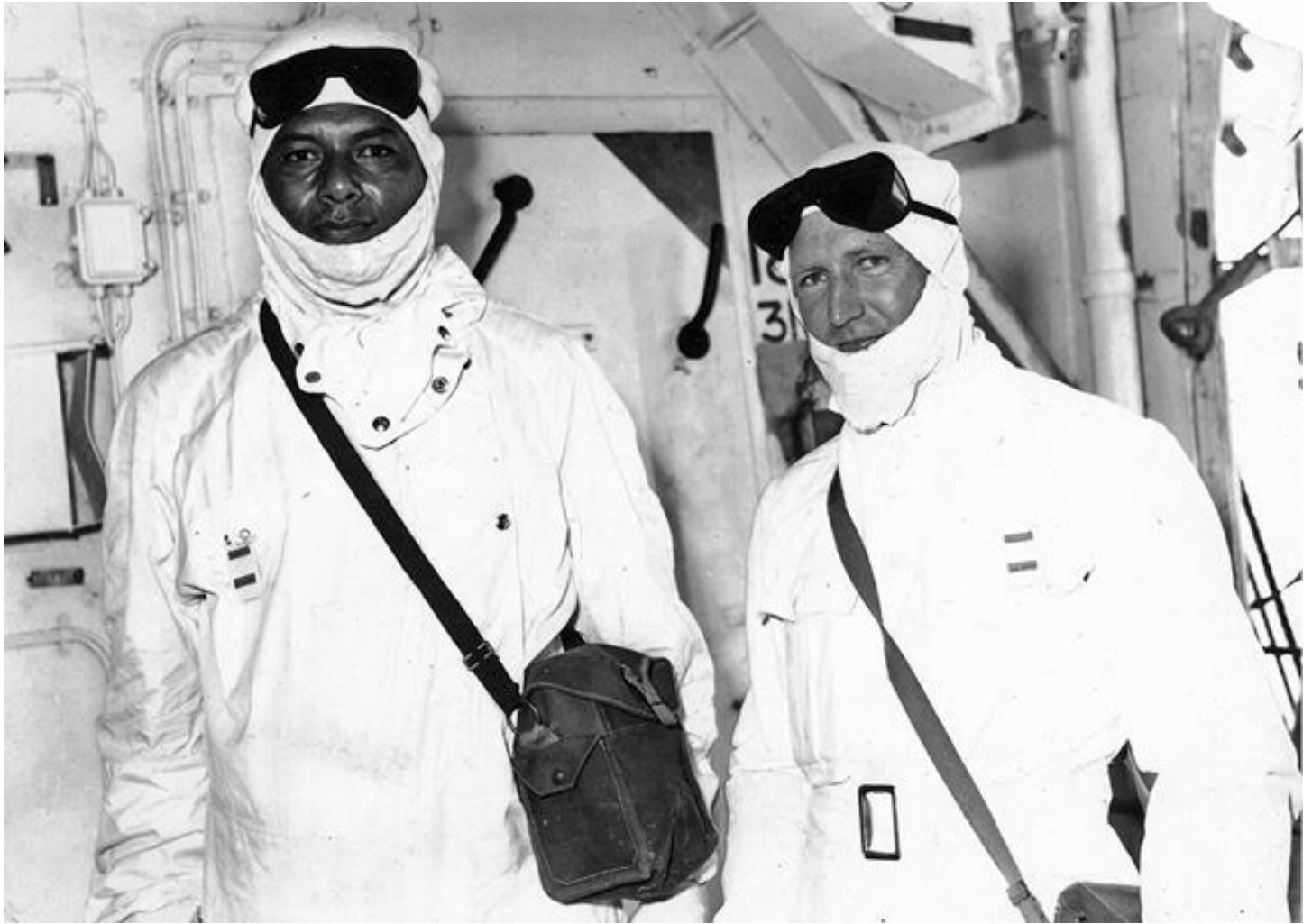
Figure 3: Distinguished Fijian officer Ratu Sir Penaia Ganilau, later Fiji's Governor General, and Fiji Royal Naval Volunteer Reserve (FRNVR) Commander Stan Brown prepare for the second UK nuclear weapons test. Photo: Courtesy of Adi Sivo Ganilau and Nic Maclellan. http://press-files.anu.edu.au/downloads/press/n2626/html/ch09.xhtml?referer=2626&page=16

military personnel in only their uniforms. 11 Even those who wore film badges later discovered in lawsuits with the British government that the film was never processed. The British military did not monitor the health of the service personnel following their service in the testing program. This may have been intentional; one RAF memo raised concerns about collecting airmen's blood samples because if they 'later developed leukaemia, it might be difficult to refute the allegations that this is due to radiation received at Christmas Island.' 12