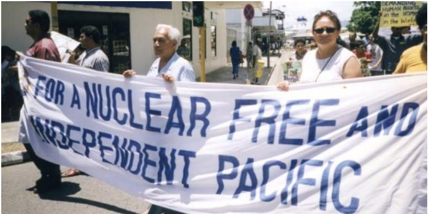
Figure 8: The Nuclear Free and Independent Pacific movement has had broad and durable support in the Pacific region from across civil society, churches, trade unions and academia, and played a major role in the effort to establish a South Pacific Nuclear Free Zone.

people from around the region in calling for the dual goals of denuclearization and decolonization. The NFIP's Pacific Concerns Resource Centre in Suva published the first collection of testimonies of Fijian Kirisimasi veterans in 1999. 70 The PCRC also supported the participation of Kirisimasi veterans in global meetings on the rights of survivors of nuclear weapons use and testing. Research for the book later developed into Nic Maclellan's definitive history of the UK nuclear weapons tests at Kiritimati and Malden Islands, Grappling with the Bomb . 71 Maclellan is also collaborating with the filmmaker Torika Bolatagici to produce an hour-long documentary on the Kirisimasi veterans. 72